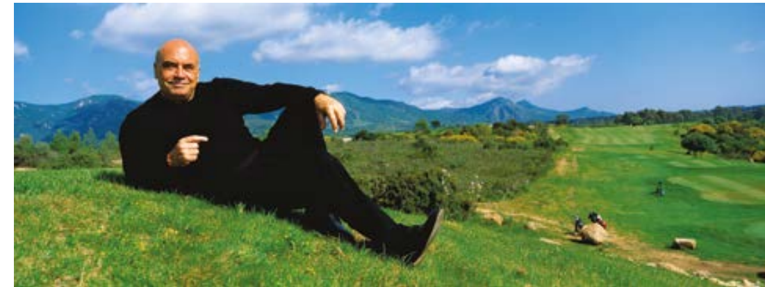
Massimiliano Fuksas and Doriana Mandrelli Fuksas

He has imagined and designed all sorts of things all over the world, museums, airports, concert halls, whole city districts, trade-fair complexes, public buildings and the showrooms of famous fashion designers. Born in Rome but of Lithuanian origin, Massimiliano Fuksas is one of the most influential and original architects on the international scene. Together with Doriana Mandrelli, architect and extraordinary designer, in charge of Fuksas Design since 1997 and curator of the "Less Aesthetics More Ethics" section of the 7th Venice Biennale of Architecture, Massimiliano Fuksas has designed the Shenzhen-Bao'an Airport, the new French National Archives, the Ferrari Research Centre at Maranello and the Twin Tower in Vienna, as well as the Peres Peace House in Jaffa, the Milan Trade Fair complex and the Theatre and Exhibition Centre in Tbilisi. At Is Molas, Massimiliano Fuksas and Doriana Mandrelli have gone back to the origins of their profession: building houses. Constructing a landscape and making those who live in it happy.