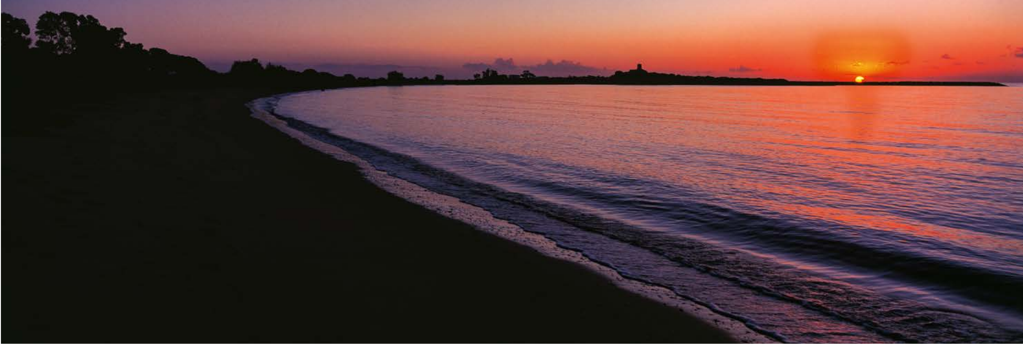
> From the rising of the sun to the fall of evening, the enchantment of the beach at Porto Agumu, dedicated to Is Molas's guests Following pages: > The dunes of Porto Pino, magic of the Sahara

The seasons of the sun, magnificent all year round