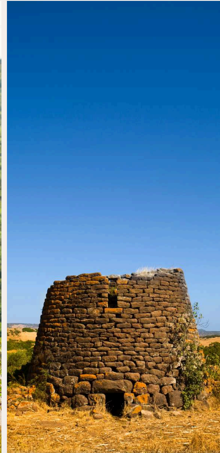
DAY 4 A Touch of Mystery