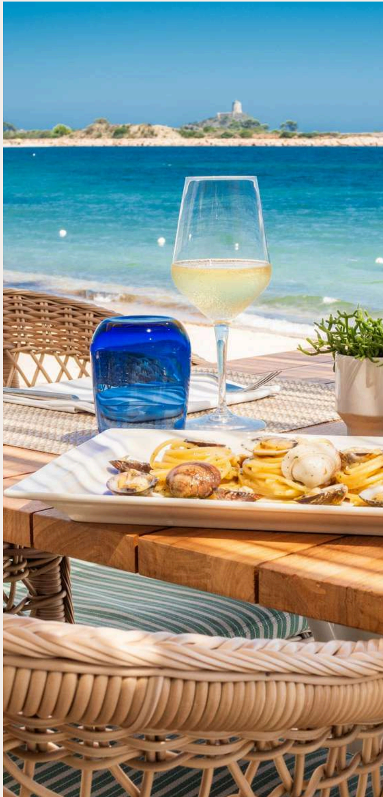
DAY 1 Shades of Blue