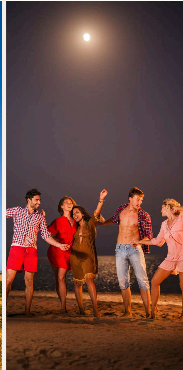
DAY 5 Dancing in The Moonlight