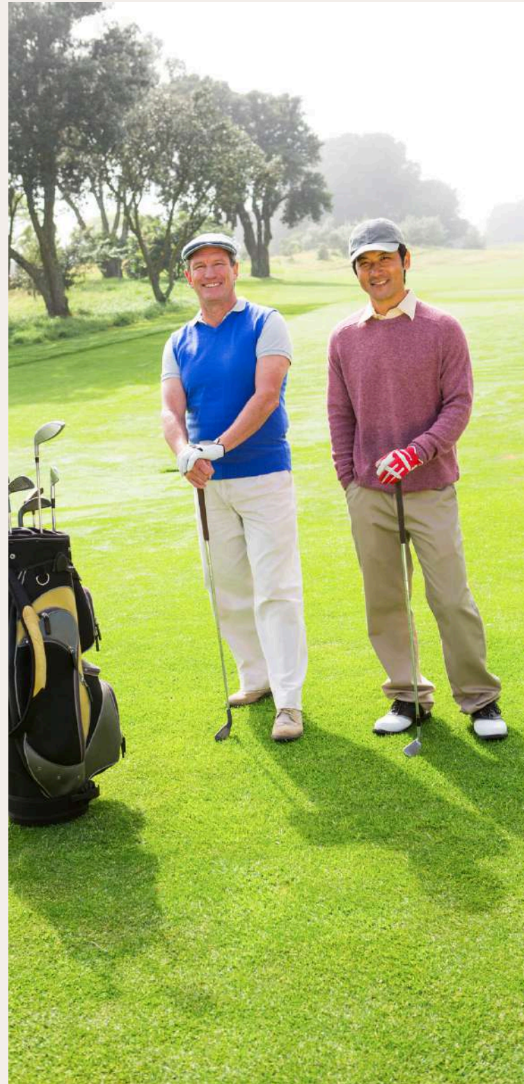
DAY 2 Foots on the Grass